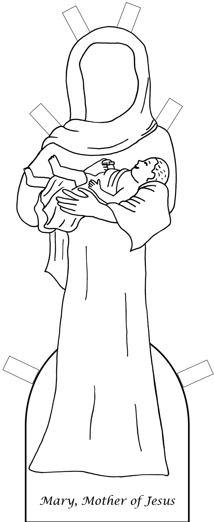
Mary, Mother of Jesus